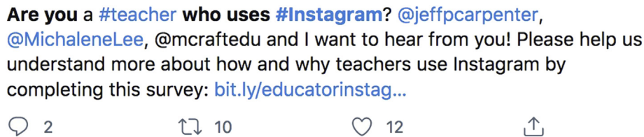
Fig. 2. Example of survey invitation posted to Twitter. [blinded for peer review].

average, participants reported 3.1 different reasons for hashtag use. Most commonly, participants sought to link their posts to similar content shared by others. For example, educators might use #iteachfirst to increase the visibility of their post among other elementary educators who teach first grade. Over half of the participants indicated they included hashtags in posts in order to increase content visibility and to be witty, humorous, or ironic. Approximately a quarter of respondents connected their hashtag